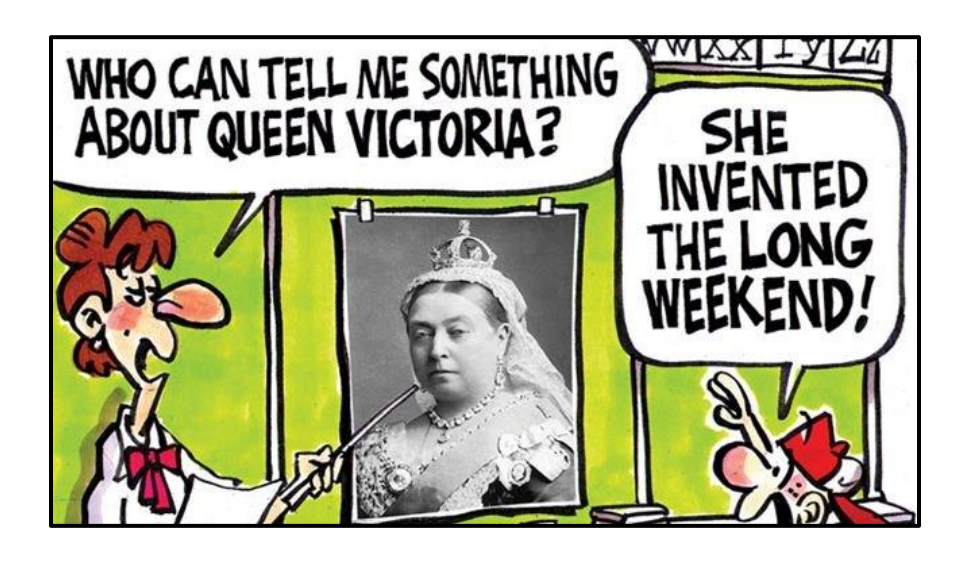
St. Luke's Community Centre will be closed on Monday, May 23